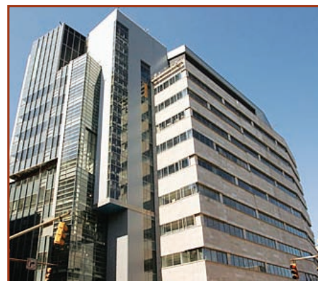
University of Pittsburgh Thomas E. Starzl Biomedical Science Tower